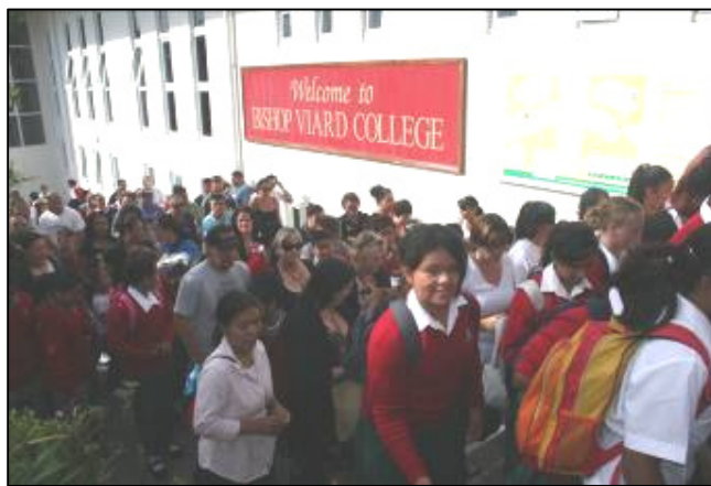
Parents, new students and new staff entering the college for the welcome Powhiri on Tuesday

Bishop Viard College PO Box 50 075 Porirua Ph. (04) 237 5248 Fax (04) 237 5888 E-Mail principal@viard.school.nz